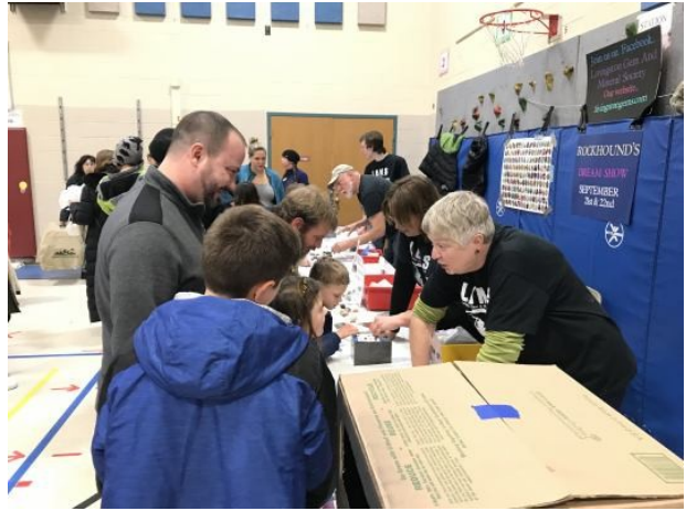
Science Fair Photos